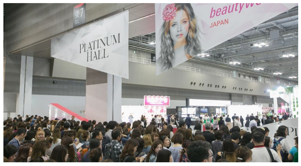
Beautyworld Japan again serves as business platform for beauty professionals.

Launched in 1998, Beautyworld Japan has grown as key trade fair to offer the latest trends in the beauty industry, and cemented its position as the largest and a must-attend platform for the beauty and spa industries in Japan and the rest of Asia.